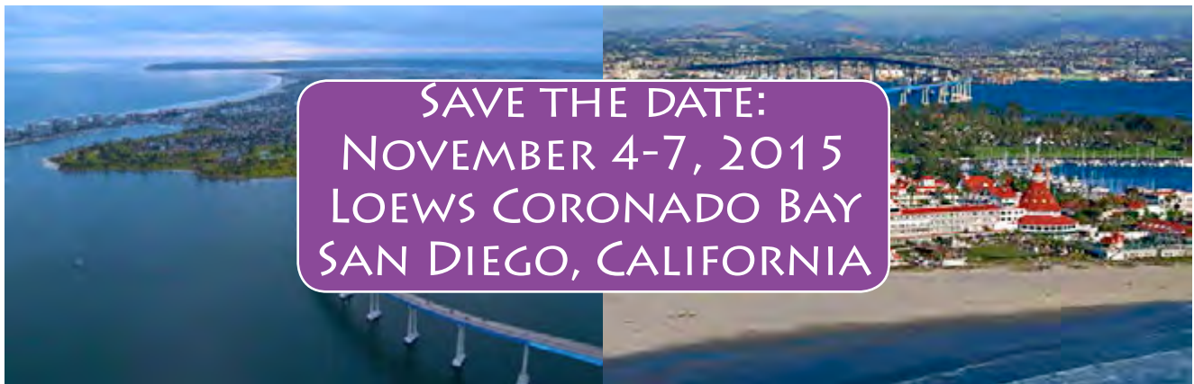
Front & Back Cover Photo: Hawaii Tourism Authority (HTA) / Kirk Lee Aeder

Please visit our exhibitors' booths in the Hapuna Ballroom Foyer.